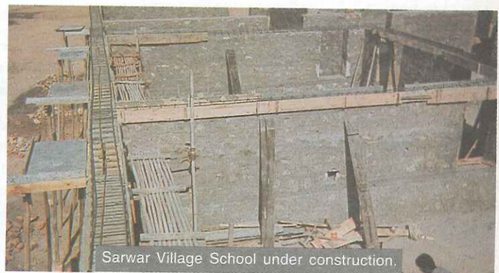
Sarwar Village School under construction.