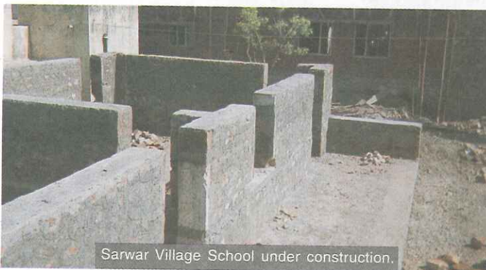
Sarwar Village School under construction.