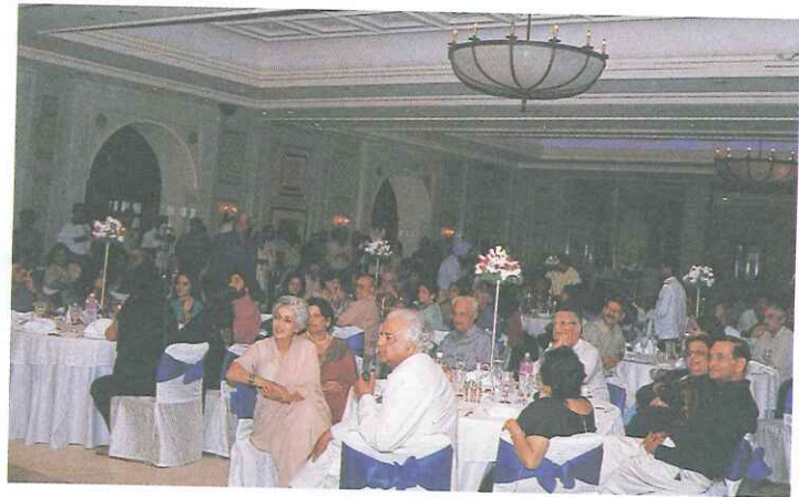
View of Party